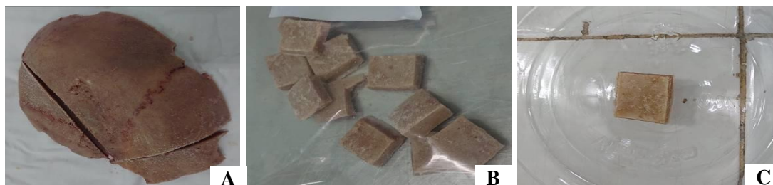
Figure 1. Bone samples are collected for demineralization. Bone samples were finely diced into bone units with an approximate dimensions of 2x2 cm

For demineralization, a total of 45 bone units were extracted from 5 standard cranium fragments. Each cranium fragment comprises nine bone units, with each bone unit measuring approximately 2x2 cm.